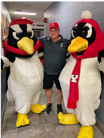
Attended YSU Games with Partnering Agencies