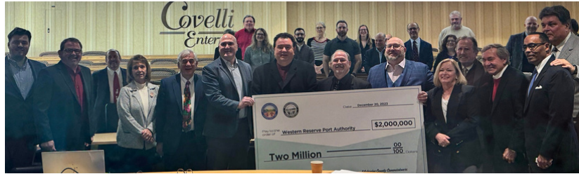
Valley Vision 2050 Partnership