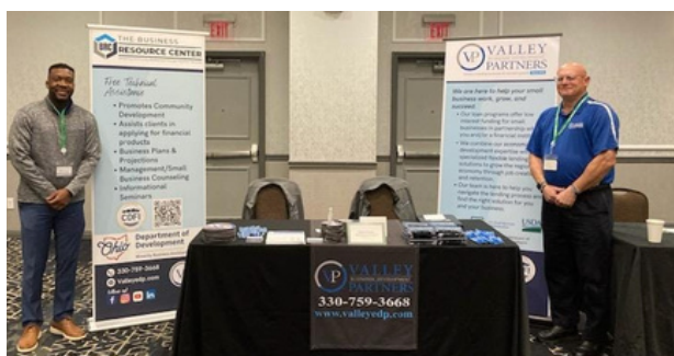
WesBanco Small Business Resource Event