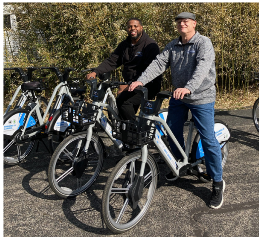
Biking with YoGo