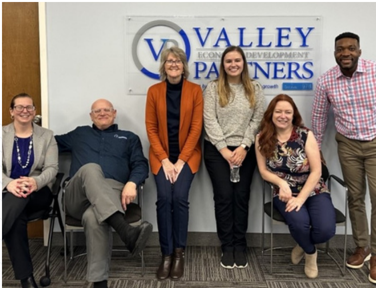
Business Resource Center Open House