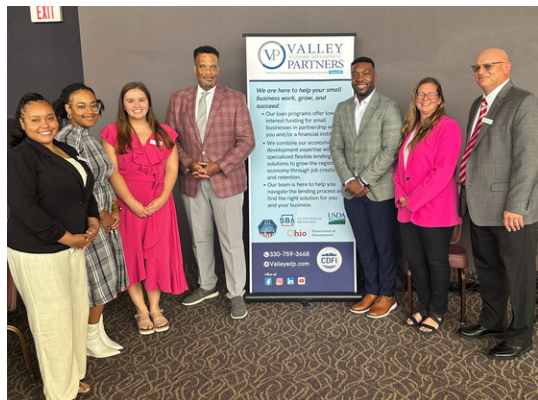
MBAC events with YBI