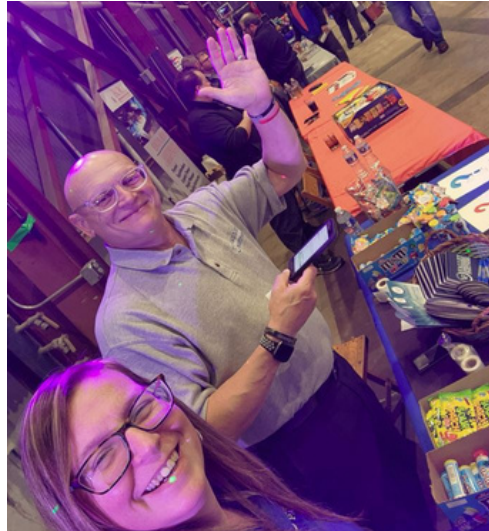
Cheers to Beers and Careers Event