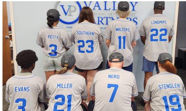
Team Building at Guardians vs Pirates Game