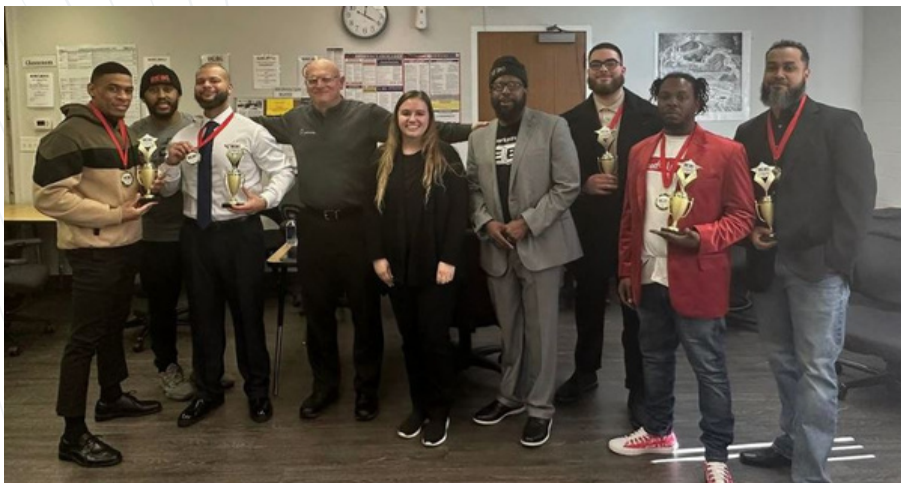
Judged BEBC Student Business Plan Presentations