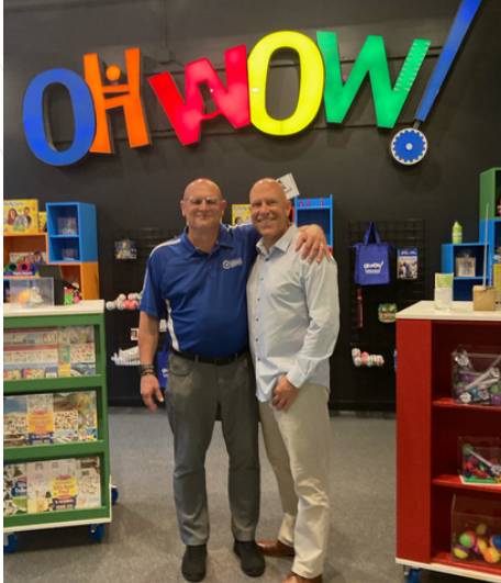
Science of Brewing Event