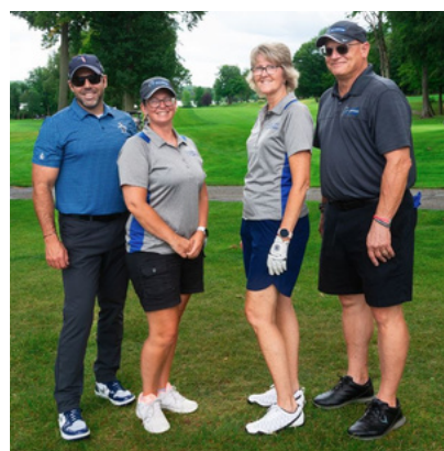
Volunteering and Golfing