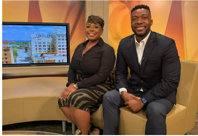
BRC Became MBAC Certified