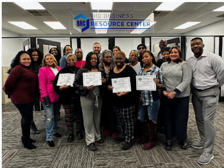
First cohort of Business Accounting & Legal Grant Program Graduates